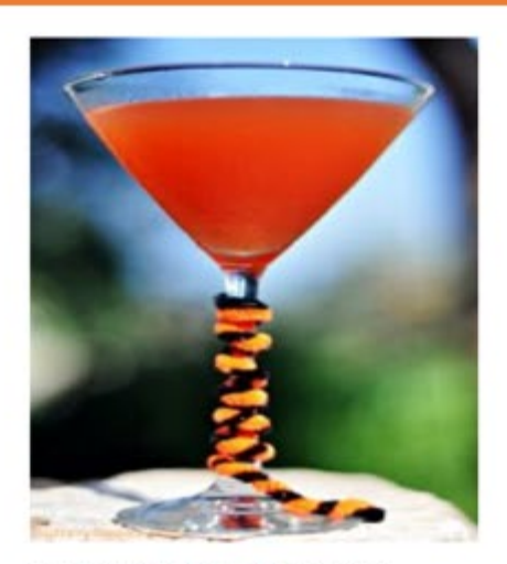
Tiger Tiger Cocktail