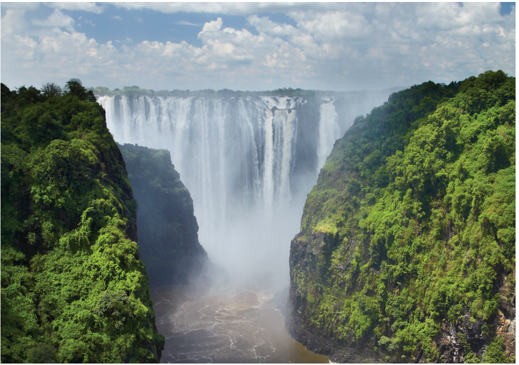
Known as the “Smoke that Thunders,” Victoria Falls is one of the wonders of the natural world.

River, where we may see hippo, crocs, and some of the park’s 450 species of birds (including the sacred ibis, carmine bee-eaters, fish eagles, and kingfishers). We dine tonight at our lodge. B,L,D