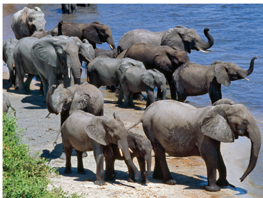
Elephants abound at Chobe.

Day 14: Arrive U.S. We arrive in the U.S. this morning and connect with our flights home.